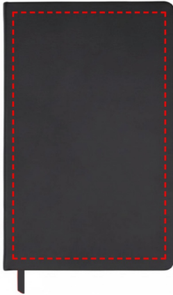
FRONT - FULL SIZE